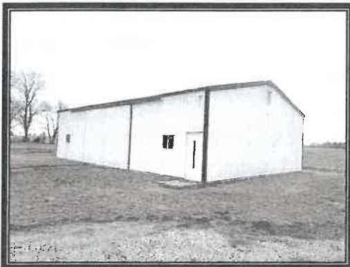
36' x 24' POLE BUILDING w/ CEMENT FLOOR