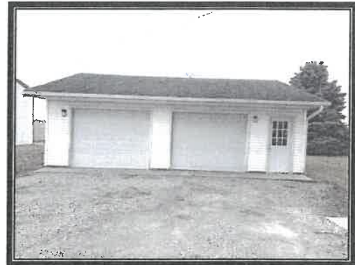
2 CAR DETACHED GARAGE